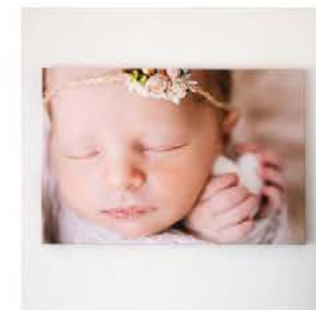
*Pictured above is the Pure Luxury Collection